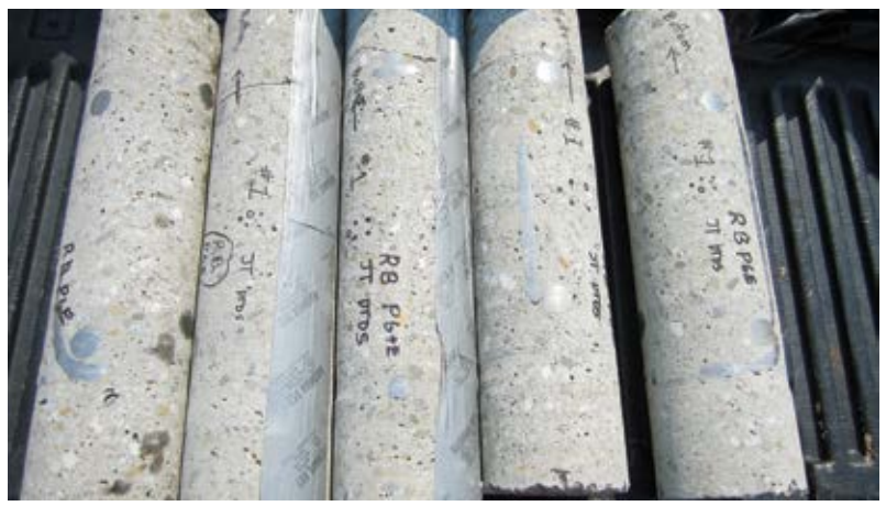
Fig. 6: Cores taken from a 24 in. (600 mm) wall that went to the testing lab for inspection

may vary in surface area from 50 in.<sup>2</sup> (3200 mm<sup>2</sup>) to over 300 in.<sup>2</sup> (19,000 mm<sup>2</sup>). I suggest a minimum 6 in. (150 mm) diameter core for best evaluation of the shotcrete in congested test panels. This size core will help prevent the core from breaking during the coring operation and will also have more surface area for evaluation.