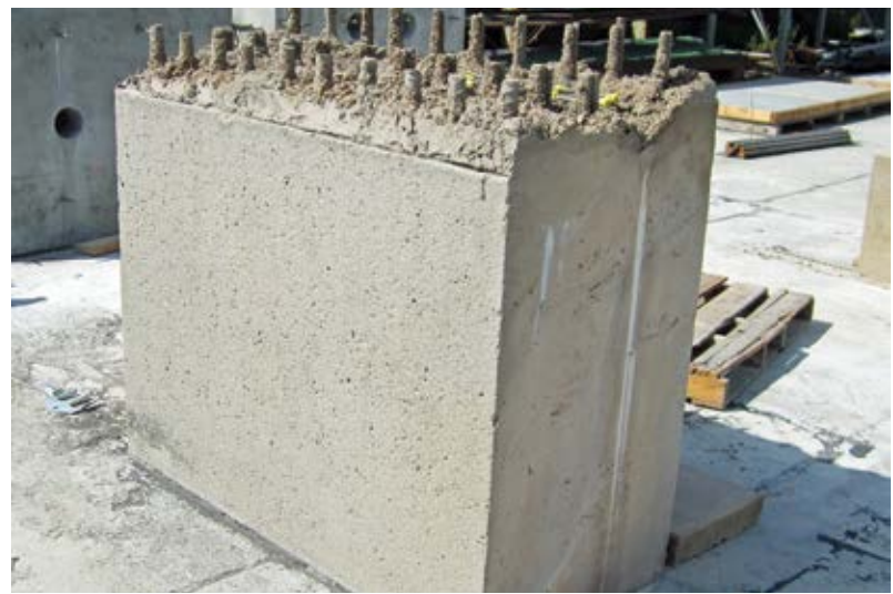
Fig. 8: Lightweight shotcrete mockup panel

In Fig. 6, all the cores taken from the test panels were good except for the core shown in Fig. 7, which had a few voids adjacent to the reinforcing bars. All cores were evaluated by the structural Engineer of Record for the project, and based on the results, approved the shotcrete team for this project. When the cores exhibit some voids, closer inspection is required, and the larger cores with more surface area and embedded reinforcement can help give the engineer a better idea of how the shotcrete placed can perform in their structural sections. Core evaluation can be very subjective, as stated previously, and it is extremely helpful to have the engineer doing the evaluation be familiarized with the shotcrete process. My practice, which I've used successfully for years, is to submit shop drawings, check for workable mixture designs, use the proper equipment (it takes horsepower to shoot heavy bar), use a qualified crew, and both communicate and involve the special inspector, testing lab, and engineer on the project. I have looked at cores for over 40 years and I have seen some that may look marginal to the inexperienced eye, but when presented to the knowledgeable Engineer of Record, are approved for the proposed project. The team approach with the qualified shotcrete contractor, the testing lab, and informed Engineer of Record really works.