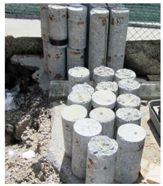
Fig. 4: Cores taken from thick wall preconstruction panels