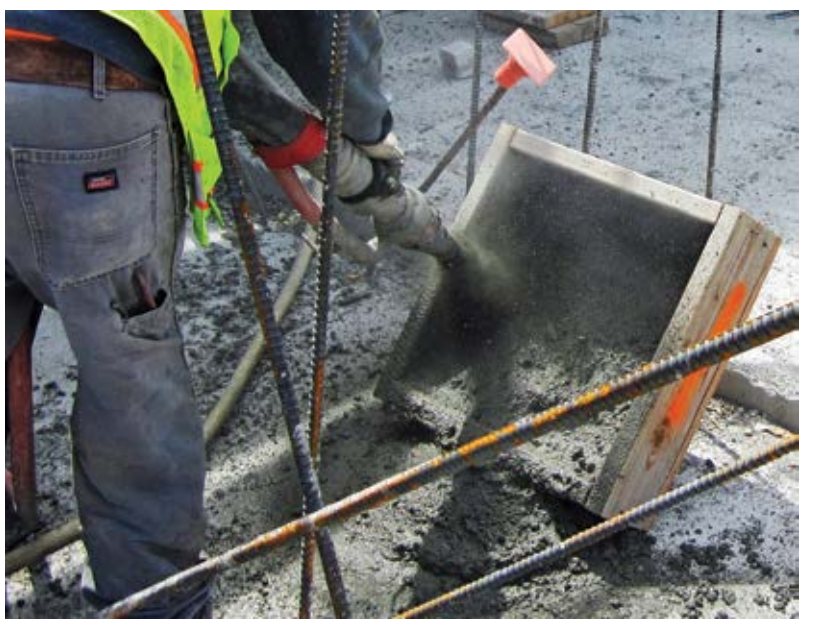
Fig. 11: Typical daily wet-mix shotcrete production panel

required. ASTM testing requires cores not be taken closer than the depth of the panel plus 1 in. (25 mm). So in a 12 x 12 in. (300 x 300 mm) by 3 in. (75 mm) deep panel, the outer 4 in. (100 mm) of the panel can't be cored, and leaves only a 4 in. (100 mm) square area in the center of the panel. If taking a 3 in. (75 mm) diameter core (the recommended minimum core diameter), you could only get one core out of each panel. Also, the 3 in. (75 mm) thickness doesn't allow any additional length to square up the ends of the core for testing. I suggest a minimum shotcrete production panel be 24 x 24 in. (600 x 600 mm) by 5.5 in. (140 mm) deep. This is 2 in. (50 mm) deeper than the ASTM C1140 minimum panel size of 24 x 24 in. (600 x 600 mm) by 3.5 in. (90 mm). The added plan dimensions leave enough room to stay well off the edge and other cores for a non-disturbed sample, and the added length allows the lab to square up the end before