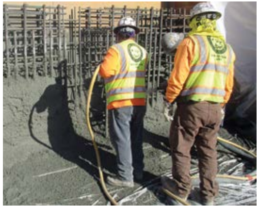
Fig. 2: Crew shooting preconstruction test panel

Core grading is a term that has been used for years for the evaluation of the concrete cores taken from preconstruction shotcrete test panels. This method has been linked to photos for acceptable and non-acceptable work taken from a now severely outdated version of ACI 506.2, "Specification for Shotcrete," published over 20 years ago in 1995. The current version of ACI 506.2 was printed in 2013 and no longer includes core grading as an evaluation method due to its lack of consistency and the inability to relate a "grade" to actual structural performance. This antiquated "core grading" method is very subjective and interpretation can vary widely from one person to another. I have been in concrete testing labs that use a paper clip to measure voids. We need to remember shotcrete is concrete, and no concrete is perfect.