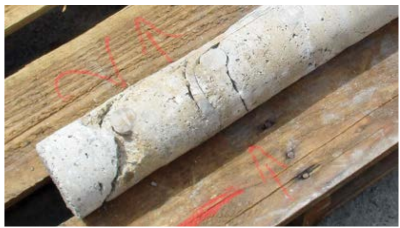
Fig. 7: Irregularities in one of the cores