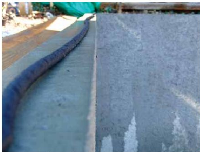
Fig. 2: A soaker hose can be useful in establishing saturated conditions prior to the application of an additional layer of shotcrete

The ideal SSD condition is attained when the existing substrate is adequately saturated and will