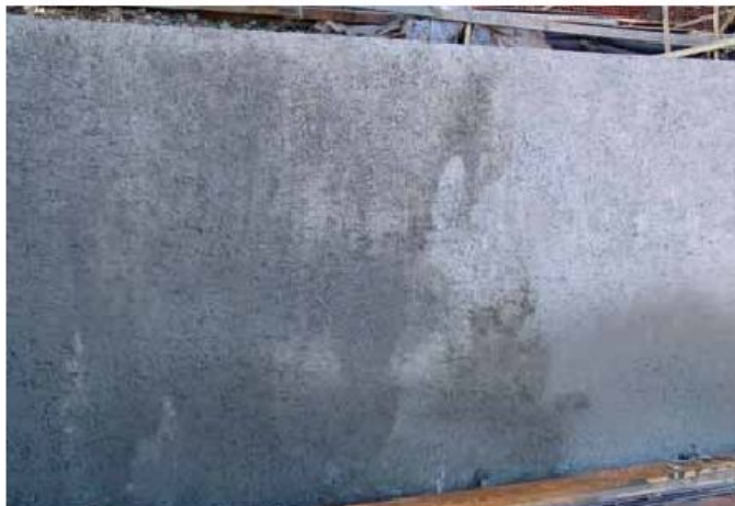
Fig. 4: Wall section at left is in SSD condition. Section area at right has lost SSD condition; additional moisture must be applied to right section prior to shotcrete application

affect bond quality. It is the skill of the nozzleman in executing SSD moisture conditions during placement that will ultimately determine the quality of the shotcrete bond.