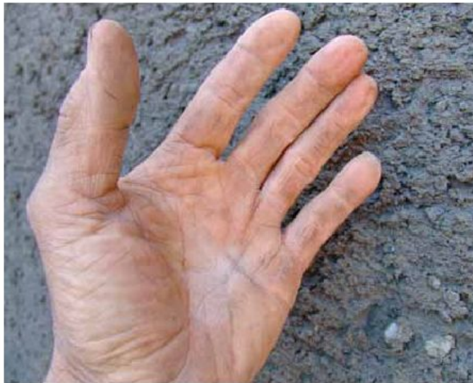
Fig. 3(b): Wall section in surface-dry condition. When touched, water is not transferred to your hand

not absorb excess moisture from the freshly embedded paste at the bond plane. Additional moisture stored within the substrate will allow hydration sufficient time to develop a strong chemical bond to the substrate. The substrate surface must be in a surface-dry condition, free of surface water that will weaken the adhesive properties of the freshly embedded paste. It is only when SSD conditions are met that pneumatically applied shotcrete's natural bond qualities are optimized. Nozzleman skill can