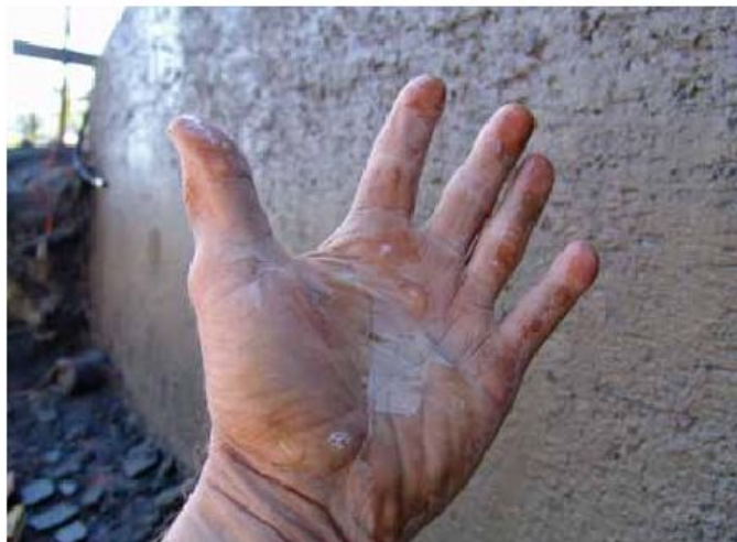
Fig. 3(a): Wall section shortly after saturation. Note its shiny surface; when touched, water is easily transferred to your hand